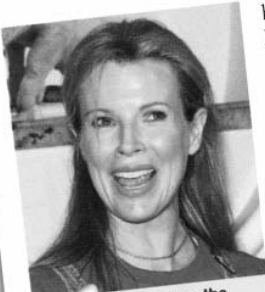
Kim Basinger brings the blues to a black-tie event.

Kim Basinger looked decidedly unglamorous on Sept. 21 when she showed up for the black-tie Farm Sanctuary Gala